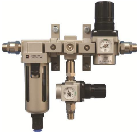
Part number: 21222P Arf Unit - Powderspray