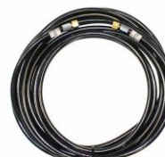
Part number 21504 Vibrator air hose – 6m