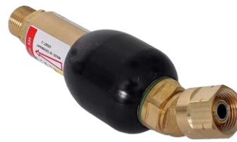
Part number: 21124 3/8" BSP LH Gas Flashback Arrestor