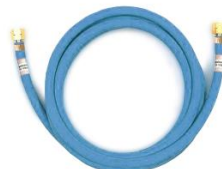
Part number 21502 Oxygen hose – 6m