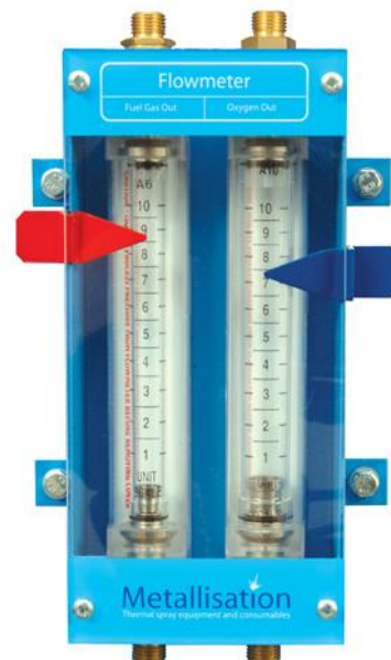
Part number 21129P Flowmeter Powder Spray