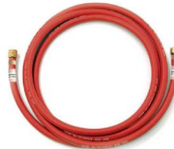
Part number 21505/3 Flowmeter Hose Acetylene x 3m