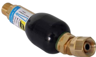
Part number: 21125 3/8" BSP RH Oxygen Flashback Arrestor