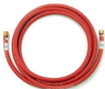
Part number 21182 Acetylene hose – 6m