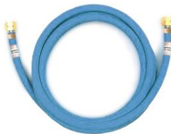
Part number 21500/3 Flowmeter Hose Oxygen x 3m