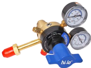
Part number: 21247 Oxygen regulator