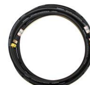
Part number: 21503 Nozzle air hose – 6m