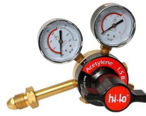
Part number: 21238 Acetylene regulator