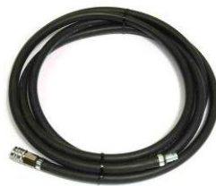
Air hose 1 off