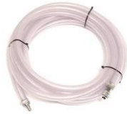
Air hose 1 off