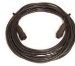
Control cable 2 off