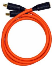
Power cables 2 off