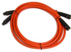
Power cables 2 off