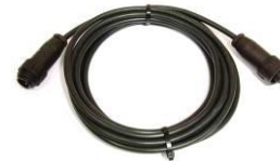
Control cable 1 off