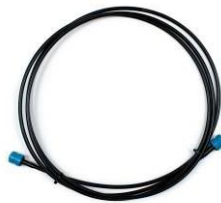
Wire conduits 2 off